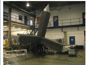
Beams mounted on their support