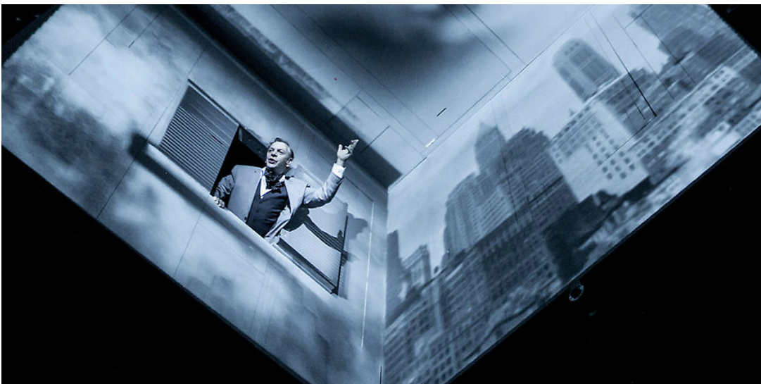
Projections on the walls allows for complete transformation of the decor