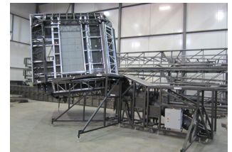
Assembly for rehearsal in the SE Studio