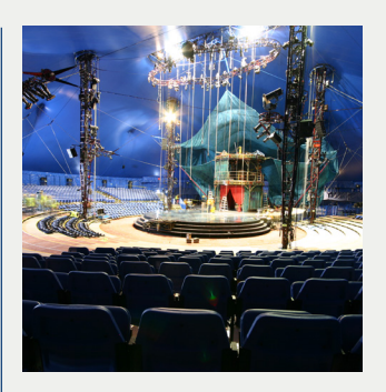
The grandstand fitted with chairs

The Bataclan is on a track system and travels downstage while being wrapped by two curved staircases that travel on its circumference to meet at the downstage center point. The upper storey is home to a series of magical characters and also the launching pad for a series of sweeping plunges by the acrobats. Although almost fragile looking, the Bataclan is also built to meet the acrobatic human load rigging needs of the acrobats.