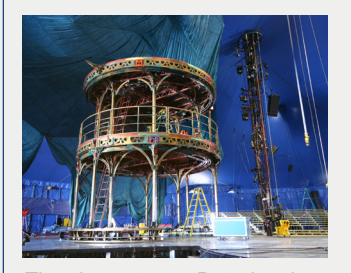
The three-storey Bataclan is set on tracks to travel downstage

2012/11 rev.1.0 Tous droits réservés. Spécification préliminaire sujette à changement