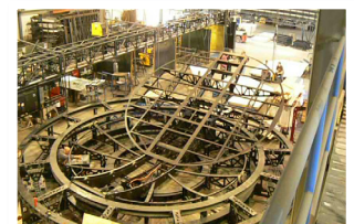
▲ Concentric circle turntable with travelling deck