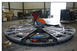
▲ Scène Éthique 1620 during set-up

Due to the simplicity of its set-up and its exceptional robustness, the Scène Éthique 1620 is very well suited for touring and for rentals. The Scène Éthique 1620 can be supplied with a simple variable speed and variable direction controller.